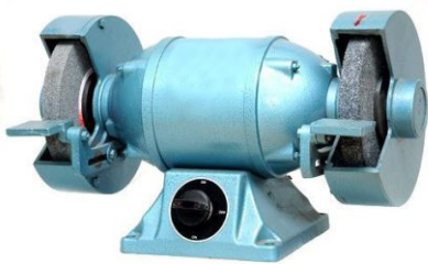
Types of machine: Bench Grinder 1" Specification: 1" – 1 Nos.