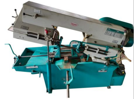
Types of machine: Bend Saw Machine

Make & model machine: Satyaprakash, Rajkot Specification: 1" – 1 Nos.