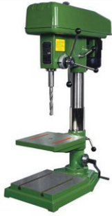
Types of machine: Bench Drilling Machine

Make & model machine: Satyaprakash, Rajkot Specification: 1" – 1 Nos.