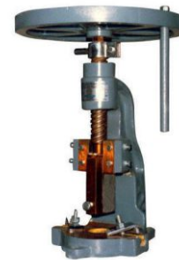
Types of machine: Hand Press Specification: 5 Ton – 6 Nos.

Make & model machine: Laxson, Rajkot Specification: Diameter 63mm – 1 Nos.