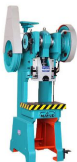
Types of machine: Mechanical Power Press Machine Make & model machine: Digvijay, Rajkot Specification: 20 Ton – 1 Nos.