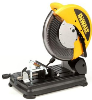
Types of machine: Pipe Cutter Machine

Make & model machine: Laxson, Rajkot Specification: Diameter 175mm – 1 Nos.