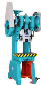
Types of machine: Mechanical Power Press Machine Make & model machine: Ravi Industries Specification: 50 Ton – 1 Nos.